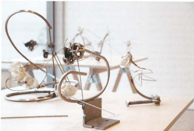
Below: Frank Stella, Circus of Pure Feeling for Malevich, 4 Square Circus, 16 Parts (detail) , 2009, stainless-steel tubing, wire, ProtoGen RPT. Installation view. Right: View of "Frank Stella: A Retrospective," 2015–16. From left: Jarmolince III , 1973; Piaski II , 1973.