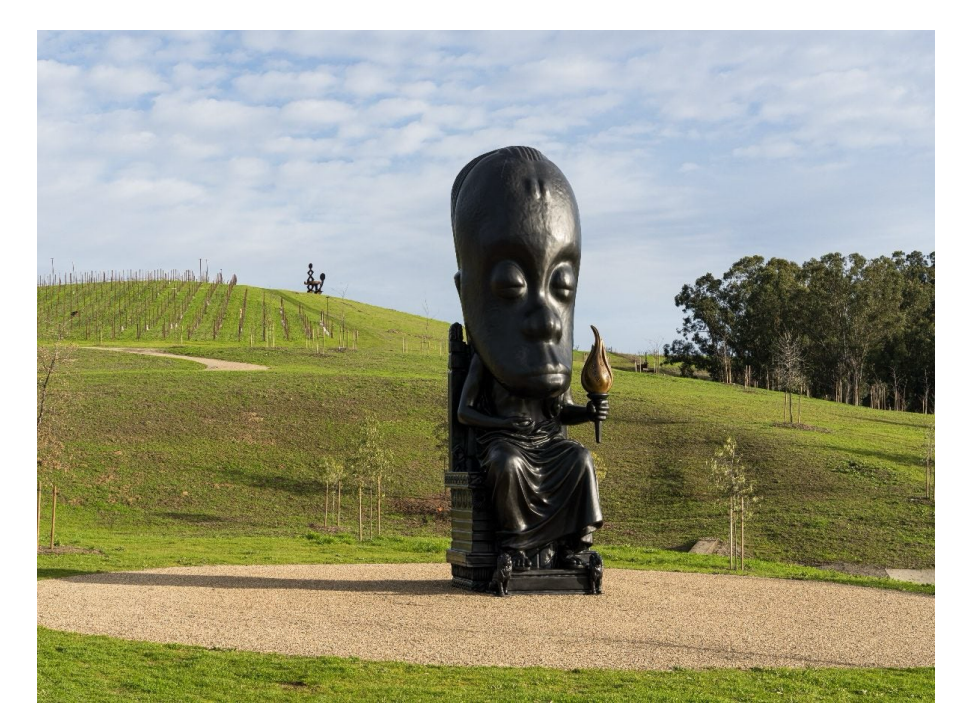
Sanford Biggers' 'Oracle' (2021) at The Donum Estate.