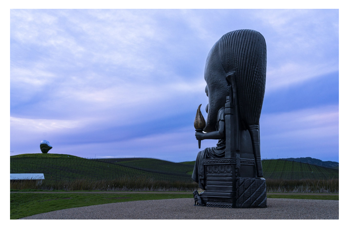
Sanford Biggers' 'Oracle' (2021) at The Donum Estate.

The artist's work—rich with references and layered symbolism—merges African and Greco-Roman influences to address historical revisionism and the "whitewashing" of classical sculpture. The seated figure of Oracle evokes the Zeus at Olympia, while its head draws from African masks and busts, challenging traditional narratives and revealing complex cultural histories. The throne, adorned with lotus blossom silhouettes, nods to Biggers' 2007 work Lotus , itself a meditation on the slave trade and its enduring legacies.