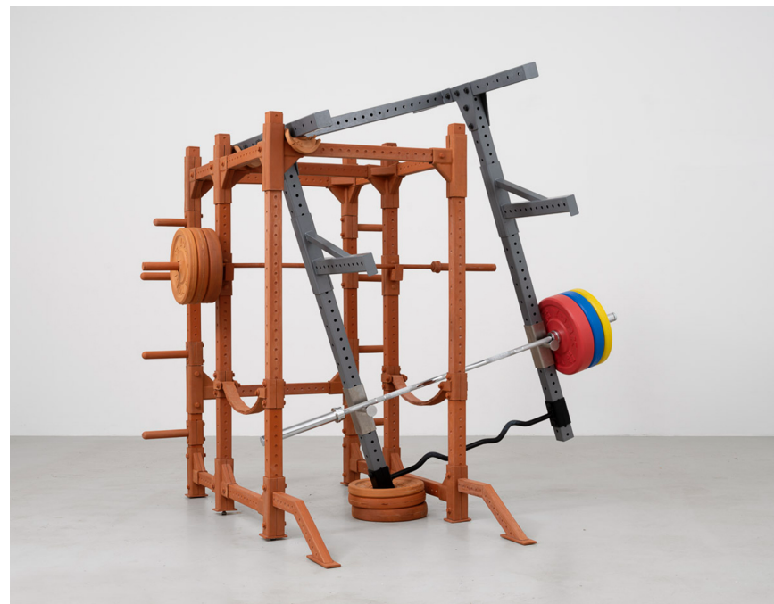
Matthew Barney, Power Rack / Iron Inversion, (2024).