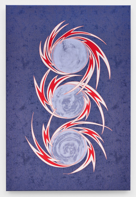
Liz Collins, Lightning Wheel, (2024).