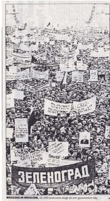
MASSING IN MOSCOW, 50,000 protesters stage an anti-government rally.