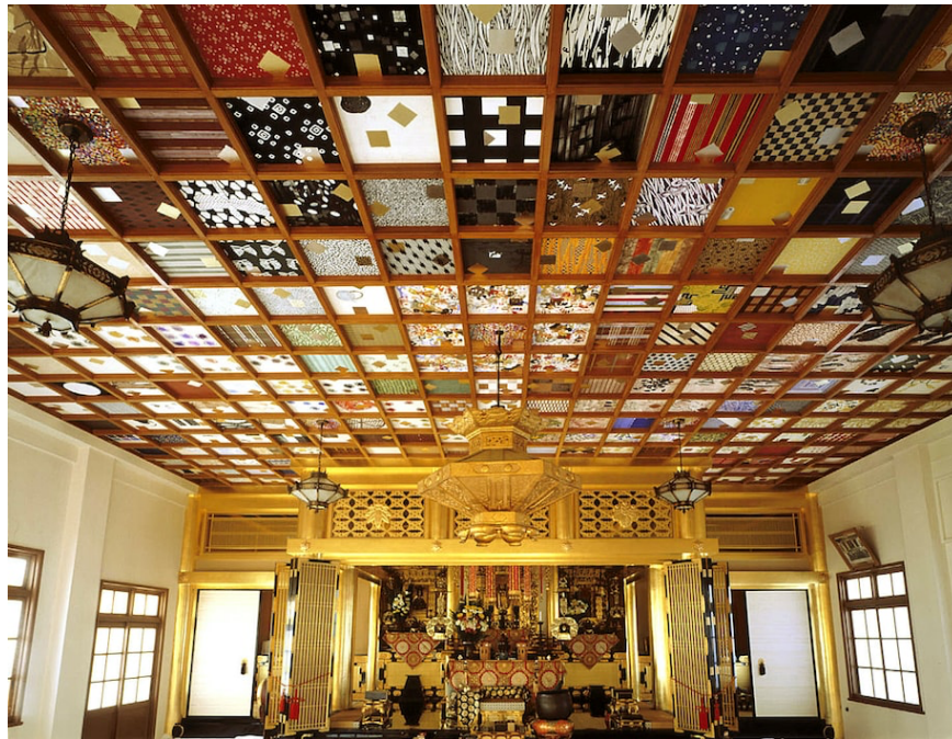
Right: In the early 1990s, Ms. Bartlett created a ceiling installation for the Homan-ji Temple in Choshi, Japan.

At the same time, she continued to make ambitious grand-scale art projects, including site-specific commissions for the lobby of a federal court building in Atlanta and the ceiling of a Buddhist temple in Japan. Her work has since been acquired by institutions including the Hirshhorn Museum and Sculpture Garden in D.C., the Metropolitan Museum of Art and Whitney Museum of American Art in New York, and the Tate Modern in London.