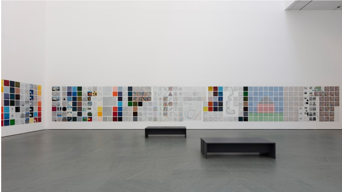
In recent years, Ms. Bartlett's "Rhapsody" piece was shown in the atrium of the Museum of Modern Art.