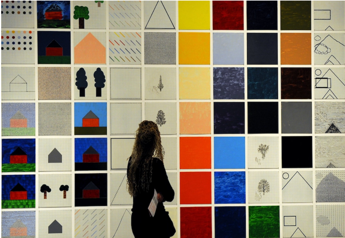
Artist Jennifer Bartlett was best known for her installation "Rhapsody," a collection of 987 painted steel plates that was acquired by the Museum of Modern Art in New York.