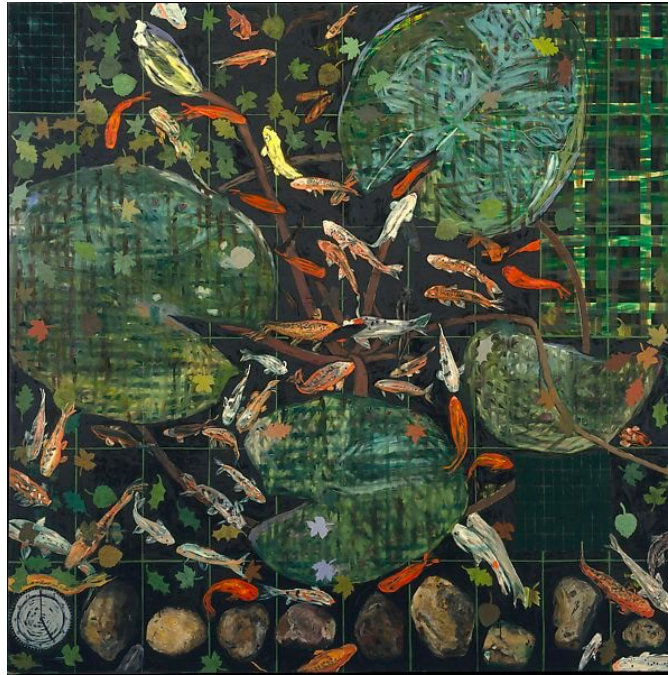
"Air: 24 Hours, Five P.M." The painting is part of a 24-piece series, one for each hour of the day, that Ms. Bartlett made in 1991 and 1992.

As she later put it, "I'd walked into my life."